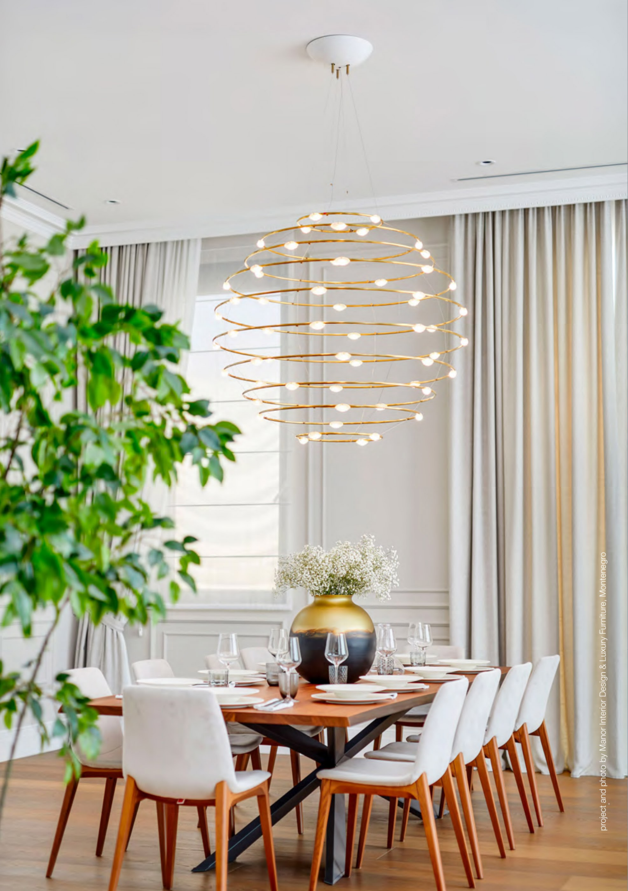
project and photo by Manor Interior Design & Luxury Furniture, Montenegro